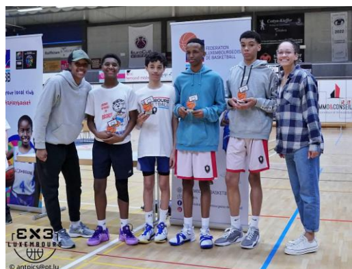
The Bucket Crew (Esch)

Congratulations to the winners of the respective categories!