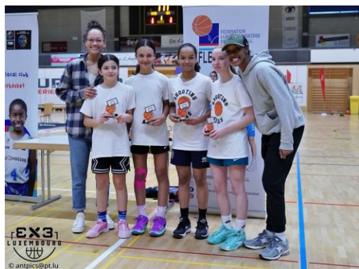
Shooting Girls (Musel, Sparta, Esch)

After lunch, the U14 girls and boys showed the audience tense and exciting games. We ended the day with 2 more winning teams : Shooting Girls U14 girls and The Bucket Crew U14 boys.