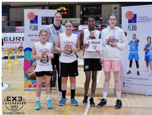
Crazy Girls (T71)

In the morning, the U12 teams competed against each other in exciting 3X3 games: Crazy Girls U12 girls and Benchwarmers U12 boys were able to ensure victory.